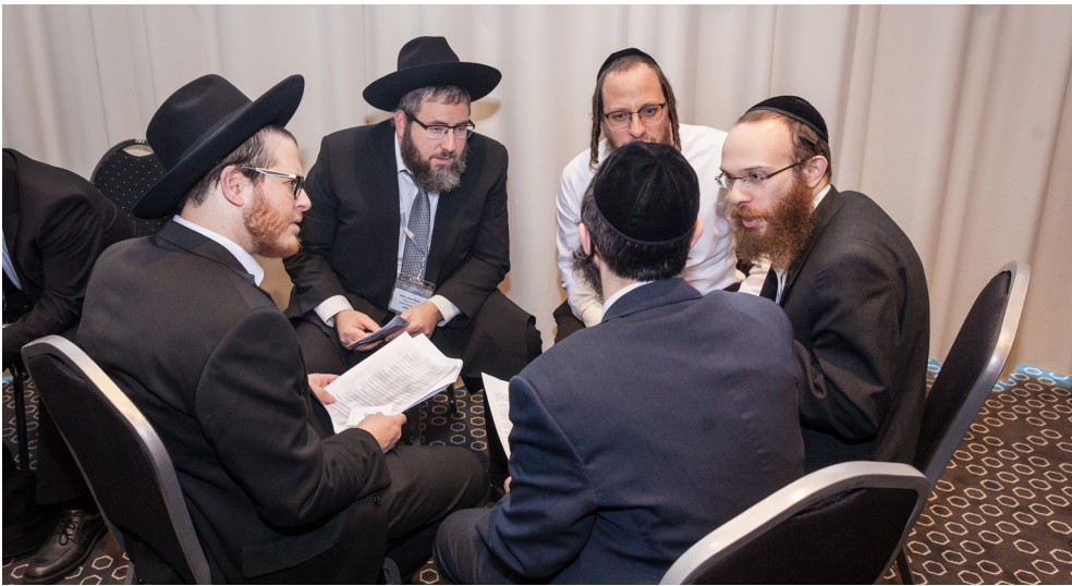
Comparing notes during the convention.