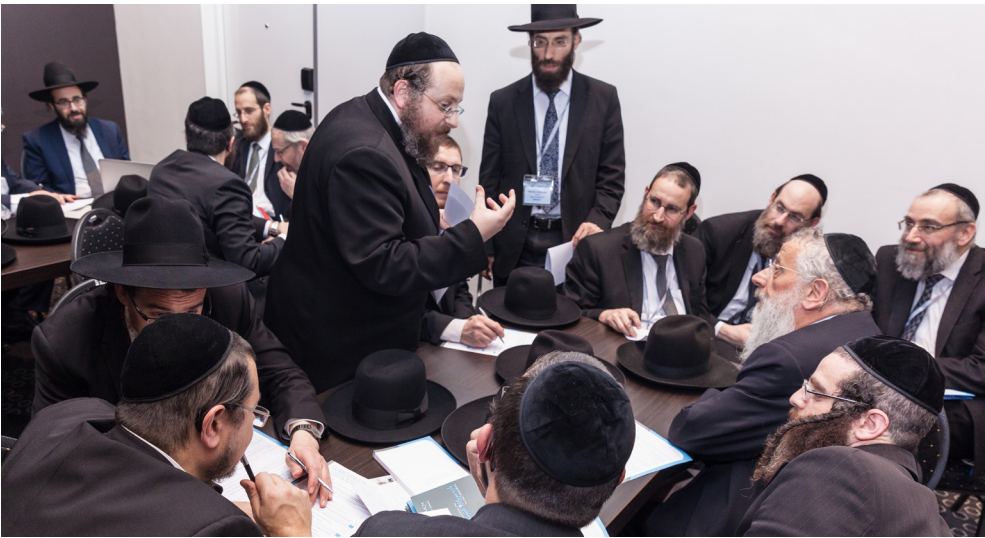
Engaging in animated discussion during a workshop session.